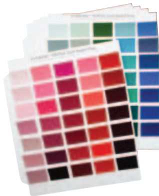
Color Swatch Files – Cotton TFC105 Three-volume set containing over 1,900 colors in 2" x 2" removable cotton swatches. New colors only TFC101