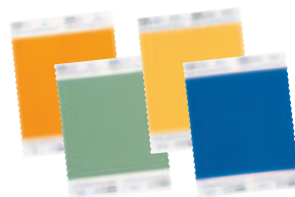
Color Swatch Cards – Cotton SWCD Individual 4" x 4" cotton swatch cards provide the most accurate way to communicate and specify color choices to clients and manufacturers.