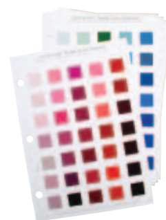
Color Selector – Cotton TFC104 Compact fabric chip reference with over 1,900 colors in one convenient binder. New colors only TFC100