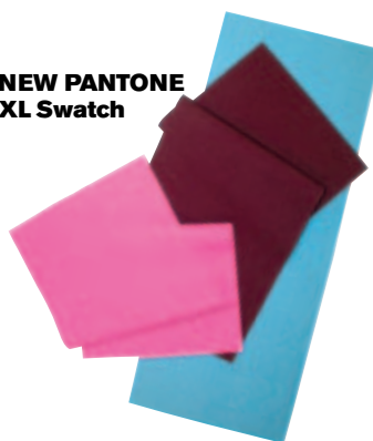
XL Swatch Choose from over 475 of the most popular colors - now available in our extra large swatch 8" by 20". For a complete list of colors, visit our Web site at www.pantone.com .