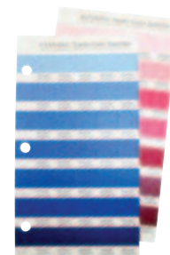
Color Specifier and Guide – Paper TPP102 Easy tear-out chips of each color. New colors only TPP100